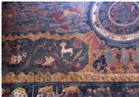
Mural in Svetitskhoveli Cathedral in Georgia